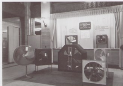
Theodor Horydczak, Electric Institute of Washington Potomac Electric Power Company Air Conditioning Displays II and V, c. 1920–c. 1950

Le Corbusier's proposition to maintain a temperature of 18°C in buildings in all parts of the world [is] irrespective of local need or preference.