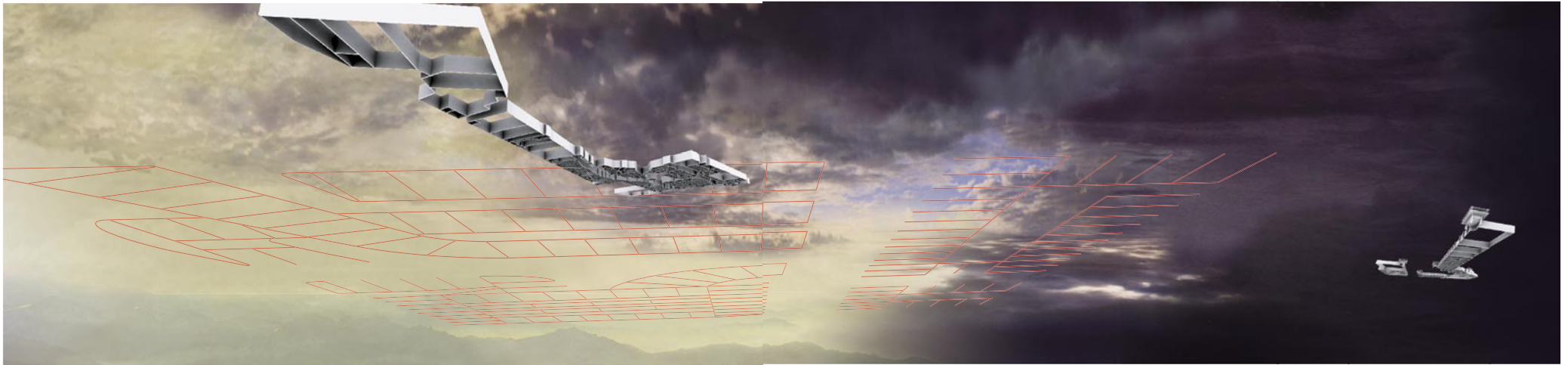
An Te Liu. Ether (section of a scroll), digital print on Tyvek, 26 x 780 in, 2004

and Ether is a history of movement and labour—the early history of garment factories, slave labour, and work camps that underpins the development of Chinatowns in North America. Instead, in both of these studies of urban sprawl there is an “ether effect,” a numbing lack of distinction and affect. The metal outlines of the malls are, as befits the society of the spectacle, both banal and spectacular.